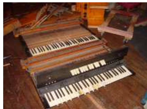
Old console shell and manuals